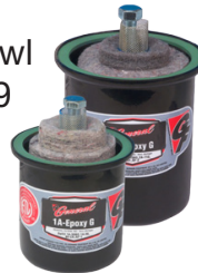
GF-10542 Epoxy Bowl 1A-25B